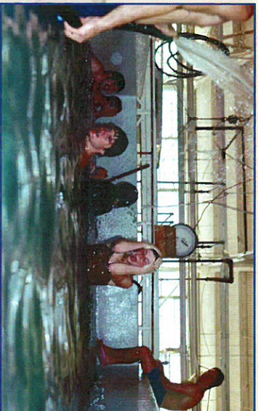
Cannery workers find time for fun, pre-season 1978.