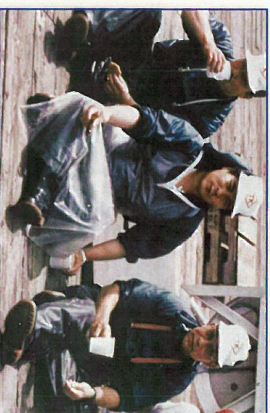
Japanese Egg House Technicians at Mug Up on the dock at South Naknek, 1988.