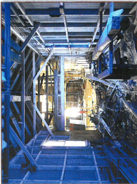
NN Cannery in 2016.

Contact us at: info@nncanneryproject.com